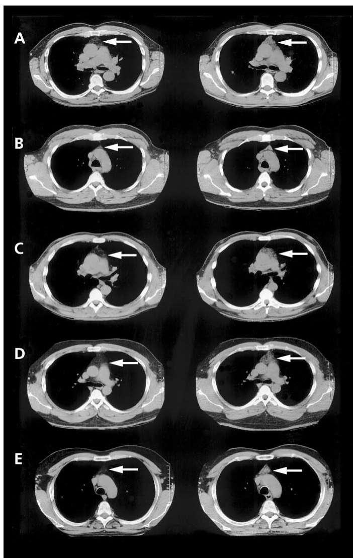
Figure 1. Reversal of thymic atrophy by growth hormone. Thymus computed tomography scans were performed at baseline and 6 months after initiation of growth hormone (GH) therapy in 5 GH recipients (A-E). Prior to GH treatment, the thymus (left column, indicated by an arrow) was seen as relatively low attenuation tissue, nearly black in color, consistent with fat density. After GH treatment (right column) the density of the anterior mediastinum markedly increased. The formerly black, fat-density tissue was replaced by higher attenuation tissue consistent with cellular thymus. Adapted with permission from Napolitano et al, AIDS , 2002.

treatment with doses of 1.5 to 3.0 mg of GH per day for 6 to 12 months. A group of 7 HIV-infected persons participating in observational studies who had similar characteristics as the group receiving growth factor were also studied for comparative purposes. The 5 GH-treated patients had a mean age of 52 years, baseline (pre-GH treatment) plasma HIV-1 RNA level ranging from less than 50 to 5700 copies/mL, and baseline CD4+ counts ranging from 254 to 853 cells/ \mu L; 4 of the 5 were on protease